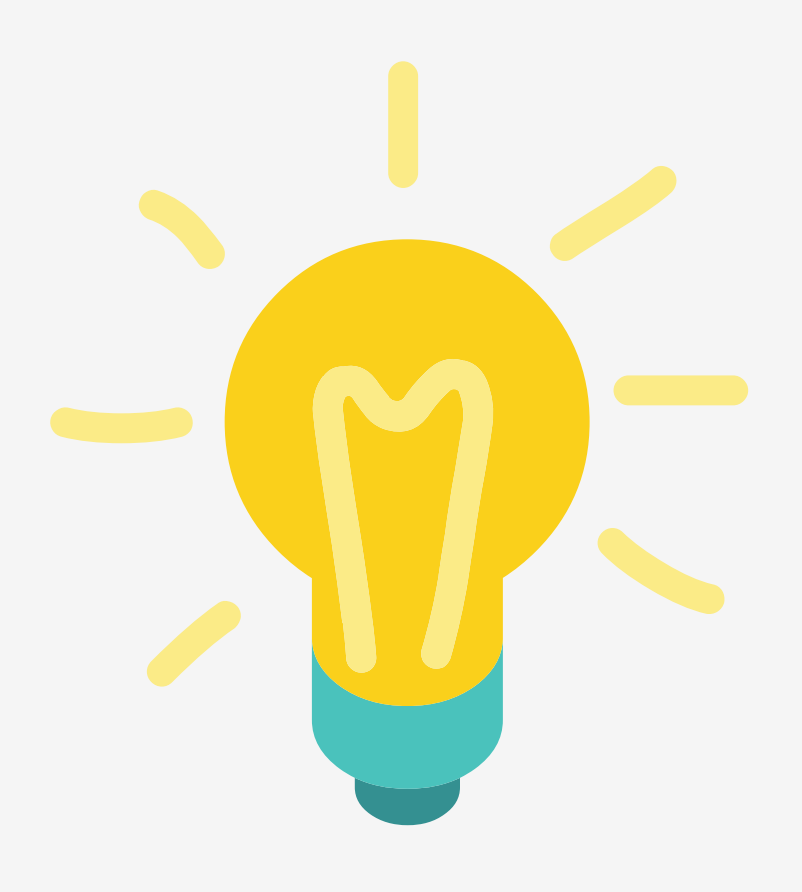
Share Your Ideas